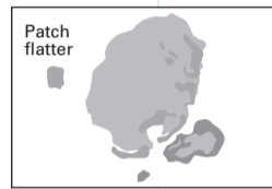
After about two weeks you may see a change in your skin. The scaly or flaky patches usually clear up first. They will feel smoother.