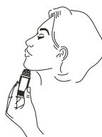
Applying the solution