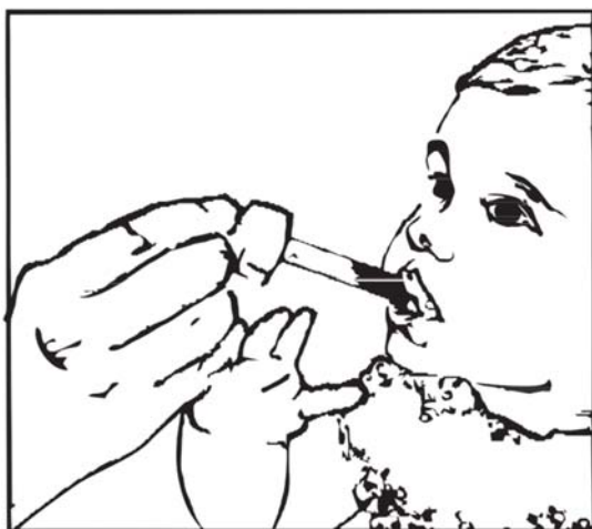
Administering the dose of the suspension

Clarithromycin oral suspension can cause a bitter after-taste. This can be avoided by drinking juice or water soon after intake of the suspension.