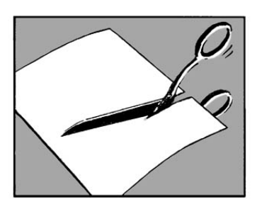
Step 3: cut the plaster, if necessary

• if required, cut the plaster to the required size to fit the painful area of skin before removing the liner.