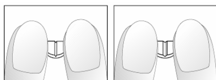
Diagrams 3 and 4: Easy breaking of half of the Nebivolol 5 mg cross-scored tablet into quarters.