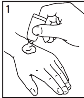
1. Pierce nozzle using spiked cap. Empty tube to form a mound of gel at required site.