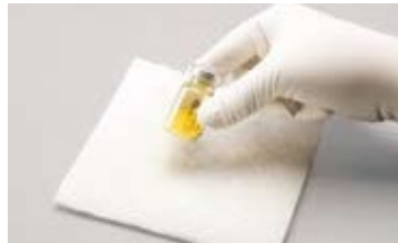
Figure A: Tap firmly to mix